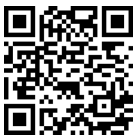
K120 3D demo