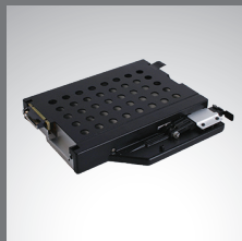
Multimedia bay 2 nd storage