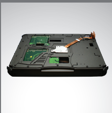
PCI/PCI-Express 3.0 expansion unit